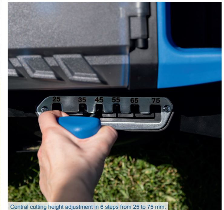
Central cutting height adjustment in 6 steps from 25 to 75 mm.