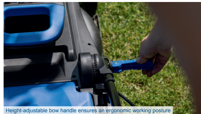
Height-adjustable bow handle ensures an ergonomic working posture