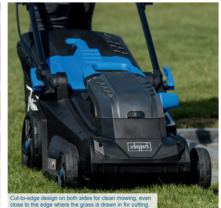
Cut-to-edge design on both sides for clean mowing, even close to the edge where the grass is drawn in for cutting.