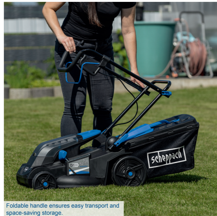
Foldable handle ensures easy transport and space-saving storage.

Specification per battery charge Running time and performance may vary depending on external conditions