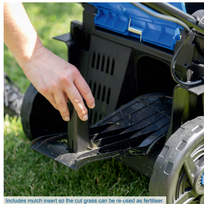
Includes mulch insert so the cut grass can be re-used as fertiliser.